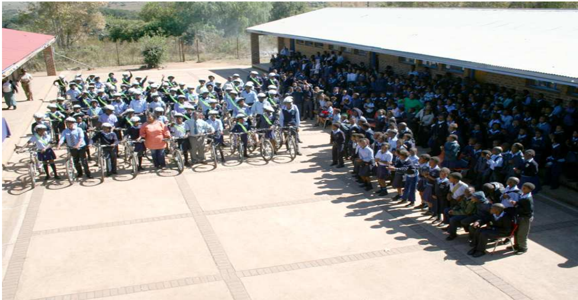
Learners receiving bicycles from the Gauteng Department of Public Transport, Roads and Works.

The WRDM, with the assistance of Gauteng Province: Department of Public Transport, Roads and Works, distributed 69 bicycles during April 2008, to learners of Matla School in an attempt to improve mobility of rural learners in the District Management Area.