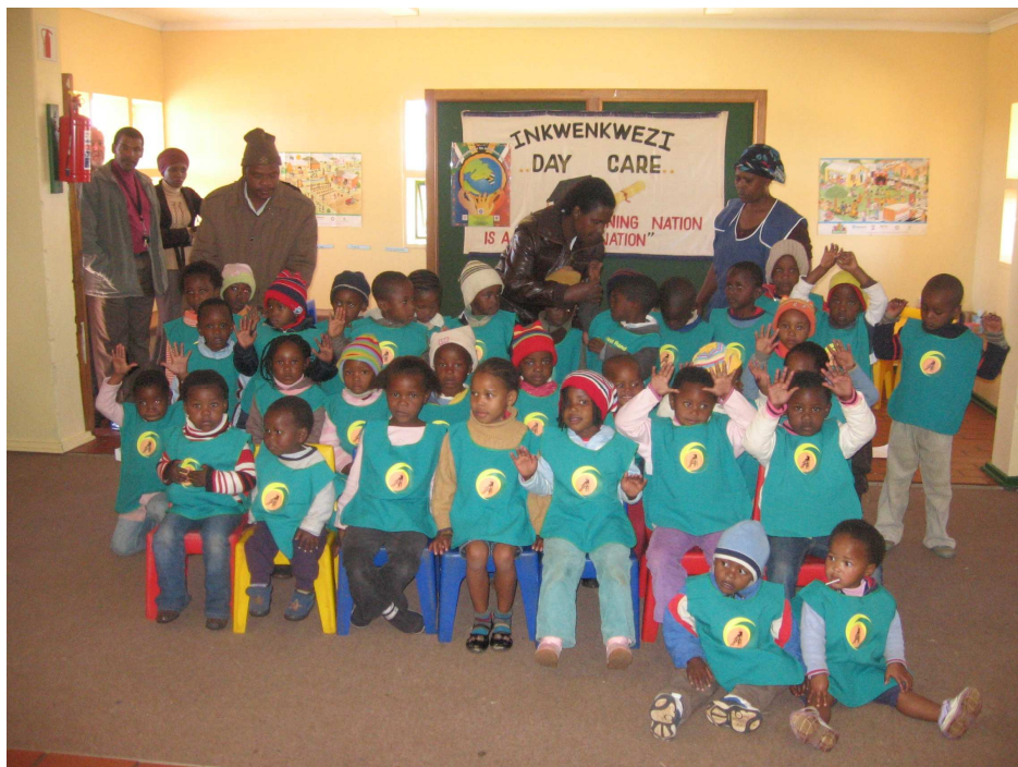
Learners with donated aprons