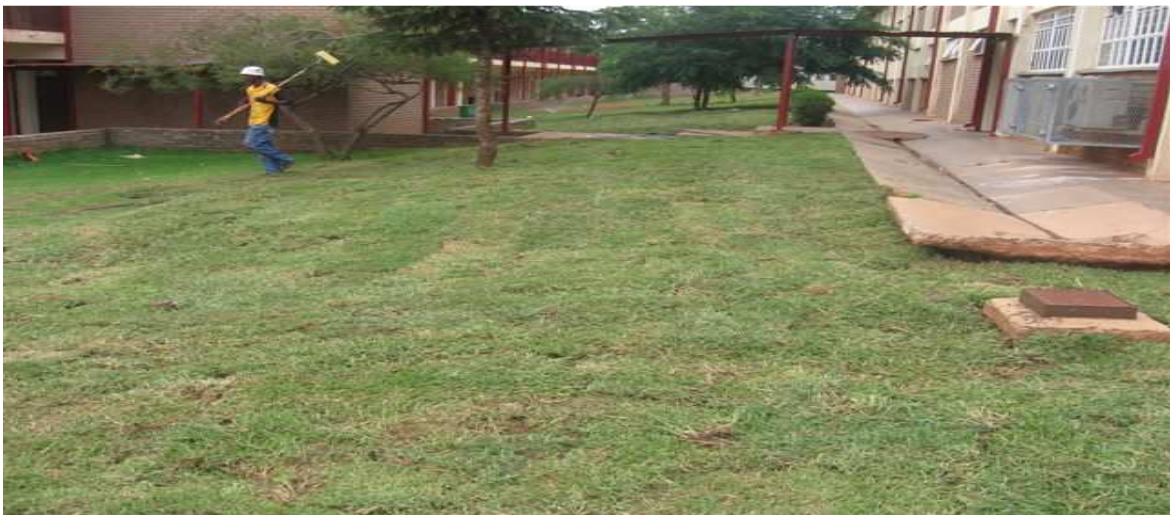
The grounds of AB Phokompe after laying of grass December 2007

The school grounds of AB Phokompe were greened with a low maintenance lawn by the Directorate and thereby creating a very healthy environment for learning.